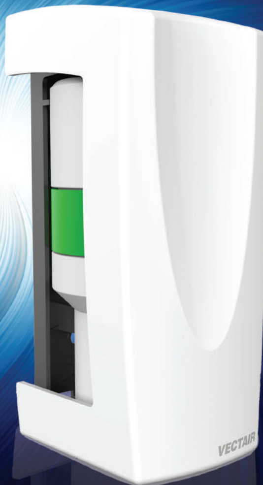
Vectair V-Air® SOLID MVP Dispenser