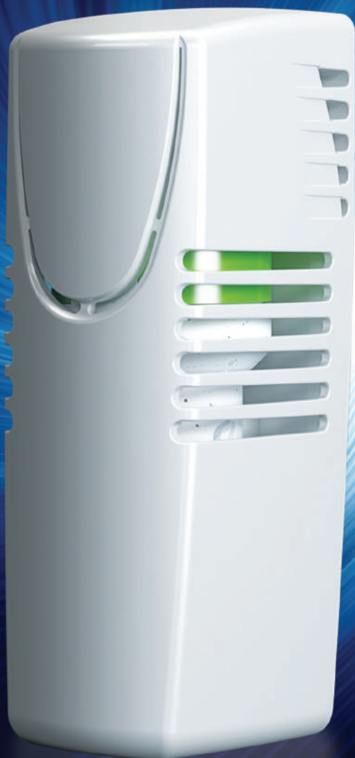
Vectair V-Air® SOLID Family Dispenser

Completely free of any harmful solvents, propellants, batteries, HFCs and the refills are VOC exempt and non-hazardous. It is the truly safe solution for your aircare needs.